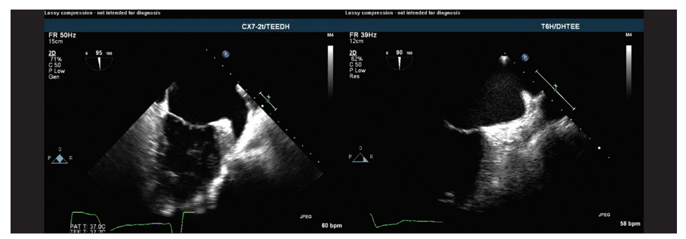
Figure 2. Transesophageal echocardiogram, showing the complete exclusion of the left atrial appendage (LAA). A) Mid esophageal two-chamber view, showing the LAA (arrow) before exclusion. B) Mid esophageal two-chamber view, showing the smooth wall of the left atrium (arrow) immediately after the LAA exclusion with the LARIAT snare

Reprinted from Massumi et al.: Initial experience with a novel percutaneous left atrial appendage exclusion device in patients with atrial fibrillation, increased stroke risk, and contraindications to anticoagulation. Am J Cardiol, 2013;111:869-873, with permission from Elsevier.<sup>13</sup>