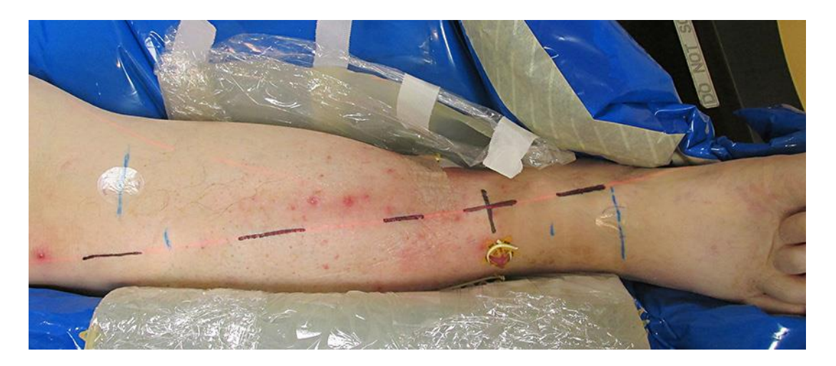
Fig. 2. Clinical features of the lesions of the right anterior lower leg prior to treatment.

Blumenthal et al.: Multiple Primary Merkel Cell Carcinomas Presenting as Pruritic, Painful Lower Leg Tumors