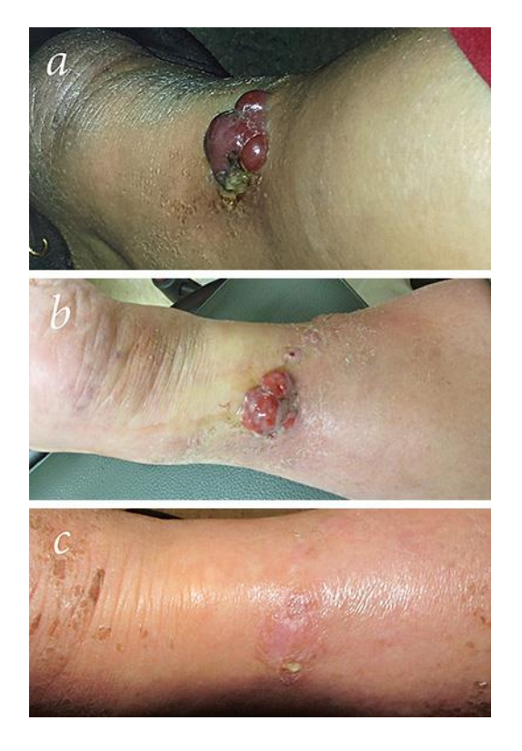
Fig. 3. Clinical features of the right posterior lower leg prior to treatment ( a ), 2 weeks into radiation therapy ( b ), and 5 weeks after treatment ( c ).

Fig. 2. Clinical features of the lesions of the right anterior lower leg prior to treatment.