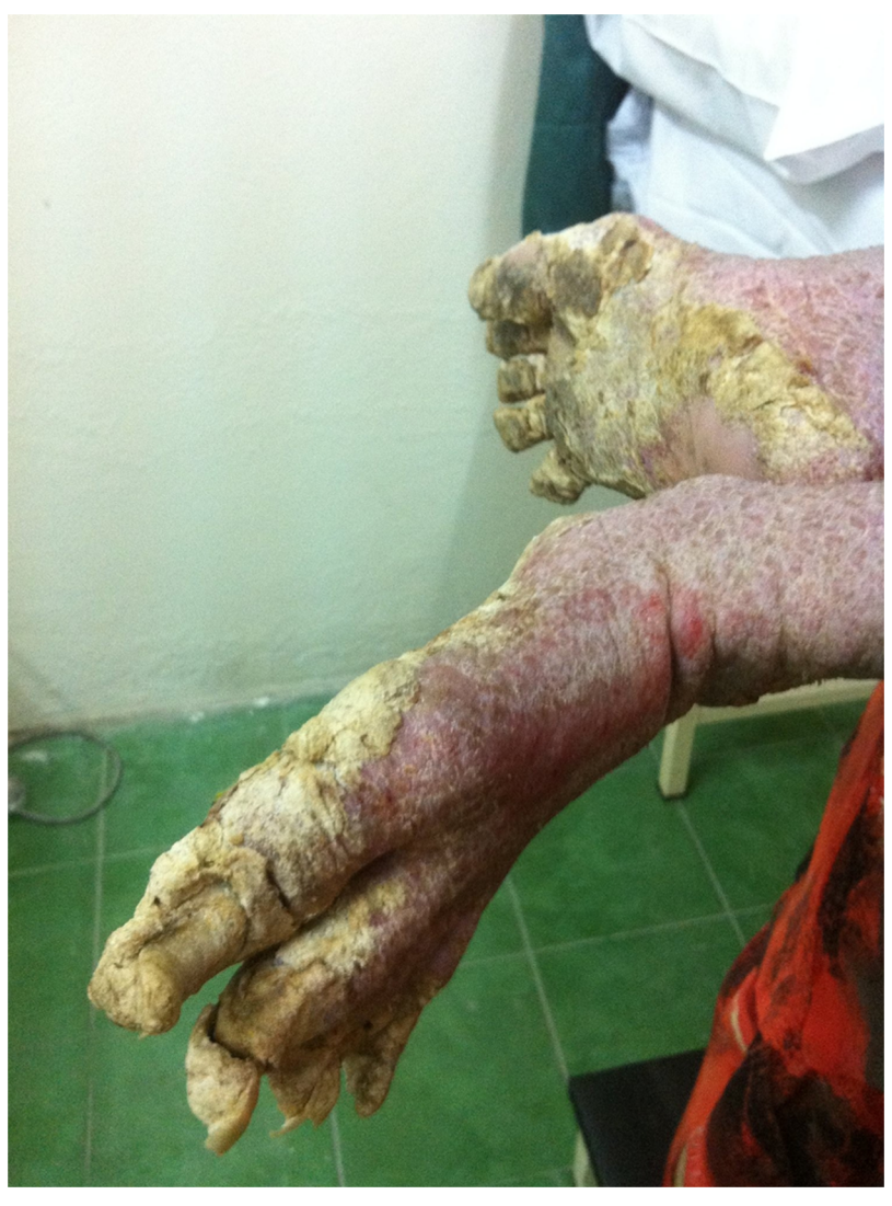
Fig 2. The deformed crusted plaques over the lower extremities made her unable to walk. https://doi.org/10.1371/journal.pntd.0005543.g002

Nevertheless, the symptom of itching should have raised the suspicion of such a condition by a general practitioner. This particular patient is intellectually challenged and thus unable to express or respond to her symptoms. The tell-tale sign of her condition is the presence of itching among family members. A high index of suspicion and good observation is required to detect this treatable disease. Any further delay in treating this condition could have led to severe infection, sepsis, and even death. Wrong topical application technique, untreated contacts and improper fomite decontamination can also lead to treatment failure at the primary care level.