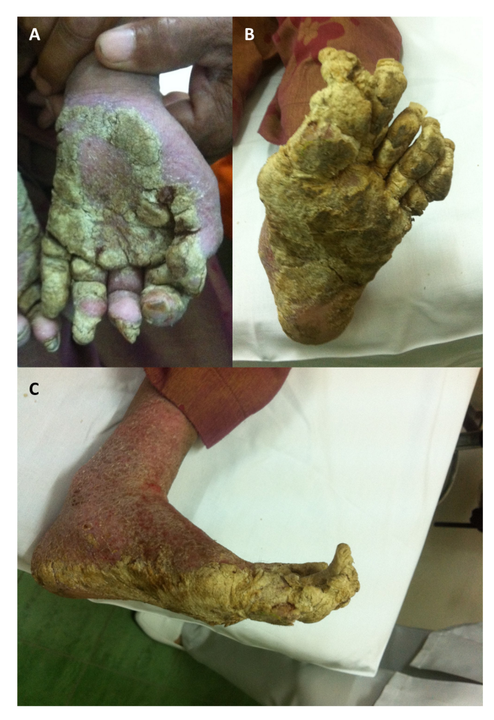
Fig 1. Extensive generalized hyperkeratotic plaques over the hands and feet. (A) Left hand palmar view. (B) Left foot plantar view. (C) Left foot medial view.

https://doi.org/10.1371/journal.pntd.0005543.g001