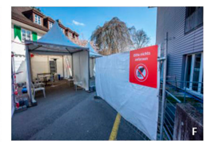
Figure 1. (A-E): Triage Unit set-up. A: Pre-Triage check point operated by Military staff. B: Patient reception, C: Waiting area, D: Clinical assessment room, E: Testing area for nasopharyngeal specimen collection, F: Triage plus tent.