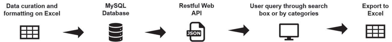
Figure 1. PlantMP database and interface. Information extracted from various databases and articles was manually curated and formatted offline on Excel before importing into MySQL database in the following format: protein name, gene uniprot_id, canonical_function_bp, canonical_function_mf, moonlighting_function_bp, moonlighting_function_mf, go_canonical_bp, go_canonical_mf, go_moonlighting_bp, go_moonlighting_mf, plant_species, pubmed_id, type. 'Type' indicates if the moonlighting function of the protein is predicted, likely or confirmed based on the literature. Database website structure was designed and developed using the front-end and back-end separation, which has the benefit of low-degree coupling. The website front-end will query the database when user invoked either the search function by UniProt ID, protein name or plant species or by selecting one of the four categories provided. At the back-end, data is provided using Restful Web API with JSON format. For example, all moonlighting proteins from A. thaliana can be retrieved by querying the URL https://www.plantmp.com/api/species?species=Arabidopsis in the web browser. For website development, an online web template provided by Colorlib ( http://www.cssmoban.com/cssthemes/8065.shtml ) was adopted and modulated with feature module for database query. Front-end only requires the setting up of the user query input as a parameter to specify API URL and then displayed in appropriate table HTML format. Users have the option to export all or selected results into Excel format.