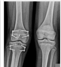
Figure 5: Epiphysiodesis with 8 eight plates.