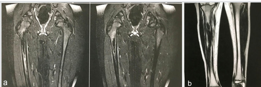
Figure 3: (a and b) Magnetic resonance imaging MRI femur and tibia with heterogeneous intensities of the endosteum, with increased uptake on gadolinium injection.

It affects the long bones rather the axial skeleton. Usually, it is a monomelic disease. The lower limbs are more often affected. The skull, spine, ribs, and facial bones are exceptions for been affected. It can be monostotic or polyostotic. Bilateral involvement is rare. In polyostotic cases, ossification may cross the joints.[1, 6, 7].