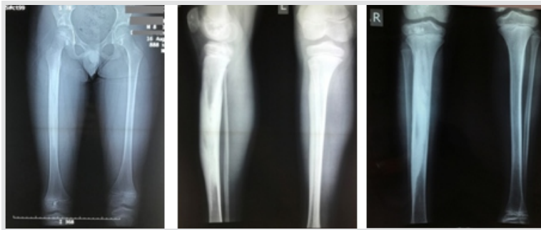
Figure 1: (a, b, c) X-ray of femur and tibia with endosteal ossification of the femur and endosteal and cortical thickening of the tibia. Ossification of the epiphysis.