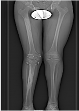
Figure 6: Scanogram at the time of removal of his eight plates, 2 years after his procedure.

Melorheostosis is usually diagnosed in childhood, adolescent, or early adult life [1, 2, 8, 9]. It can be an incidental finding in an X-ray examination. Usually, it presents with pain, contractures, and deformity that may be initially confused with arthrogyriposis, if they affect the hand or feet [9].