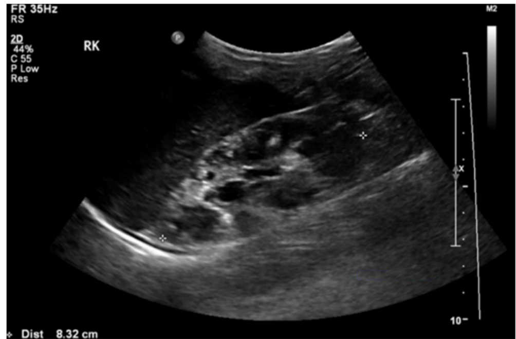
Figure 2. Renal ultrasound showed loss of corticomedullary differentiation of the right kidney with multiple cysts of variable sizes.

Magnetic resonance angiogram revealed diffuse aortopathy involving the aortic arch (5 mm in diameter at isthmus), thoracic aorta (7 mm), and abdominal aorta (5 mm). The main branches from the aorta were also affected, including bilateral renal artery stenoses (RAS) and narrowed celiac trunk and superior mesenteric artery (2–3 mm in diameter) (Figure 3). The Doppler ultrasound did not show focal stenosis in her common, internal, or external carotid arteries.