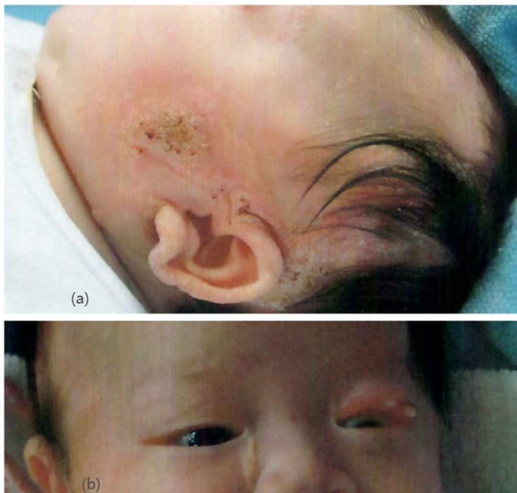
Figure 1. (a) (upper) Nevus sebaceous over the left face and scalp. (b) (lower) Lipodermoid at the left upper eyelid.

balloon aortoplasty six weeks after the surgery. At two months old, she also had multiple episodes of focal seizures involving her left limbs. She was put on oral carbamazepine and has remained seizure-free since six years old. The magnetic resonance imaging (MRI) of her brain and spine showed right frontotemporal lobe pachygyria and a lipomatous lesion at the thoracic spinal cord.