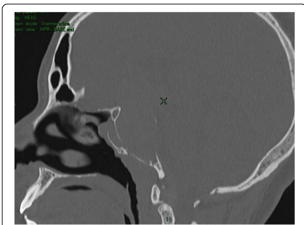
Figure 1 Sagittal CT image of the pituitary macroadenoma showing the bony erosion of the sellar floor and of the anterior wall of the sphenoid sinus.

At endoscopic transsphenoidal approach a large bony defect in the inferior part of the sphenoid sinus was detected, obstructed by a massive tumor protrusion. Intraoperatively,