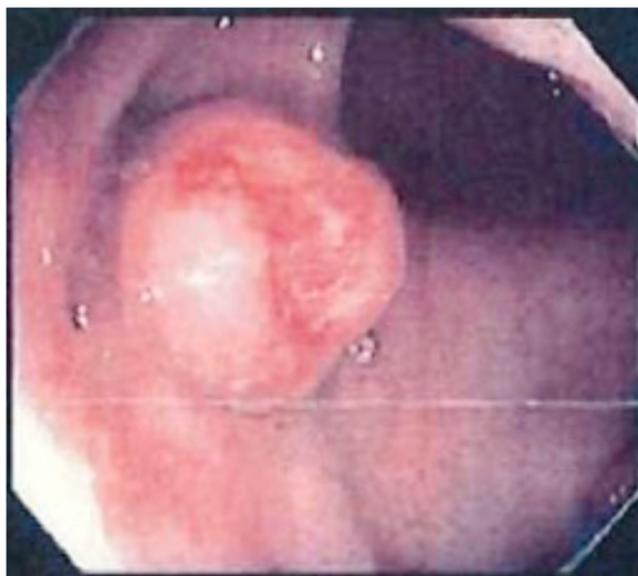
Fig. 1 Endoscopy image of the primary tumor in case 1. Submucosal tumor with ulcer in the rectum

A 55-year-old woman underwent EMR for rectal NEN (Fig. 1). The pathological findings were as follows: well-differentiated NEN, tumor size 13 mm, no muscular invasion (submucosa), negative resection margins, no lymphovascular invasion, and Ki-67 < 1%. She underwent colonoscopy at 1, 2, 3, 6, and 9 years after EMR for rectal NEN, but no recurrence was revealed. At 10 years after EMR, she visited our hospital complaining of bloating, weight loss, and leg edema. Abdominal computed tomography (CT) revealed multiple liver masses in the bilateral lobe (Fig. 2a) diagnosed as multiple liver metastases by biopsy concordant with the initial tumor. Since immunohistochemistry staining of the liver metastasis showed somatostatin-2 receptor (SSTR-2) positivity, monthly intramuscular octreotide 30 mg was administered. The symptoms got worse, and daily oral everolimus 10 mg was added 4 months after the initial treatment. However, she developed pneumonia 3 weeks after the start of everolimus. Everolimus was changed to weekly streptozocin 1000 mg. Stable disease (SD) was achieved and maintained