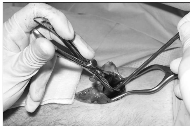
Figure 2 A Killian nasal speculum allows excellent visualisation of the radial tuberosity while avoiding damage to surrounding structures.

excellent visualisation of the radial tuberosity while avoiding damage to surrounding structures (Fig 2). The radial tuberosity is directly visualised, minimising any risk of incorrect placement of drill holes for the anchor sutures.