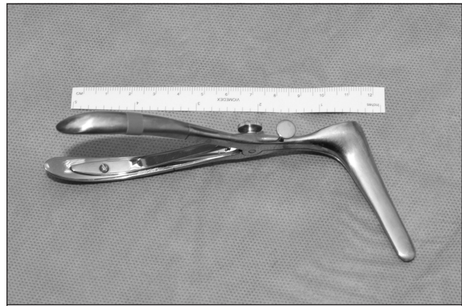
Figure 1 Killian nasal speculum

The modified Henry approach to a biceps tendon repair allows a direct approach to the radial tuberosity although clear visualisation of it from this approach is difficult. It is particularly important to visualise the radial tuberosity well in order to avoid poor placement of the bone anchors, with the potential to give poor function of the biceps tendon. We have found using a Killian nasal speculum (Fig 1) allows