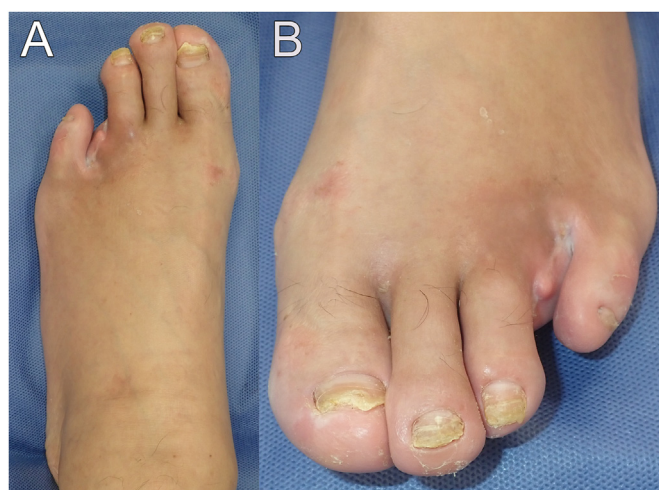
Fig. 3. Post operative findings of the 58-years old male. Photograph (A) and (B) show the front and expanded views of the fourth toe removed area treated by “Elephant-trunk” technique, respectively. At 4 months after artificial dermis grafting, no recurrence of ulcer was observed. The morphology of the fourth toe removed area was favorable.

two cases contained no nonrevascularizable patients who are known as no-option CLI patients, and for treating no-option CLI patients, the application of “Elephant-trunk” technique will require more attention, because the patient's blood stream is known to be quite poor, and the wound site could be intolerable against infection and necrosis.