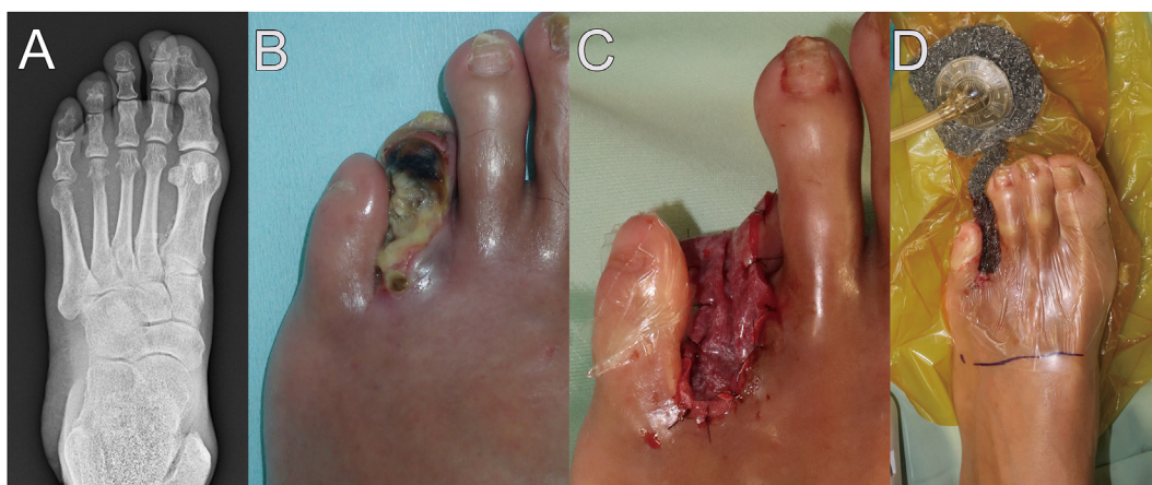
Fig. 2. Preoperative X-ray image and intraoperative findings during the treatment of the left necrotic fourth toe of a 58-year-old male with critical limb ischemia. A. X-ray image of the left foot revealed the destruction of distal phalanx of the fourth toe. B. The left fourth toe found to be necrosis. C. After the distal part of metatarsal bone of fourth toe was amputated under local anesthesia, human recombinant basic fibroblast growth factor was sprayed, and artificial dermis was grafted onto the wound site with 5-0 nylon. D. The artificial dermis was fixed using NPWT with “Elephant-trunk” technique.

wound site, (2) improves an oxygen environment in the tissue [16], (3) equalizes body-fluid pressure between the irregular-shape wound and highly mobile areas [17], and (4) immobilizes the grafted site without splint [17]. This study suggested NPWT was an effective dressing for fixing artificial dermis found in the poor blood flow such as critical limb ischemia. During NPWT treatment in this study, the pressure was set at -80 mmHg, which is reported to be used for fixing full thickness skin graft without complications such as hematoma, seroma, and pressure pore [18].