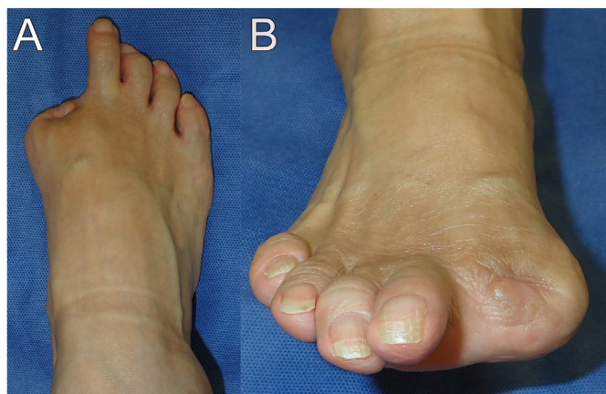
Fig. 5. Post operative findings of the 58-years old male. Photograph (A) and (B) show the front and expanded views of the fourth toe removed area treated by “Elephant-trunk” technique, respectively. The morphology of the 7 months after artificial dermis grafting, no recurrence of ulcer was observed. Morphology of the first toe removed area was favorable.