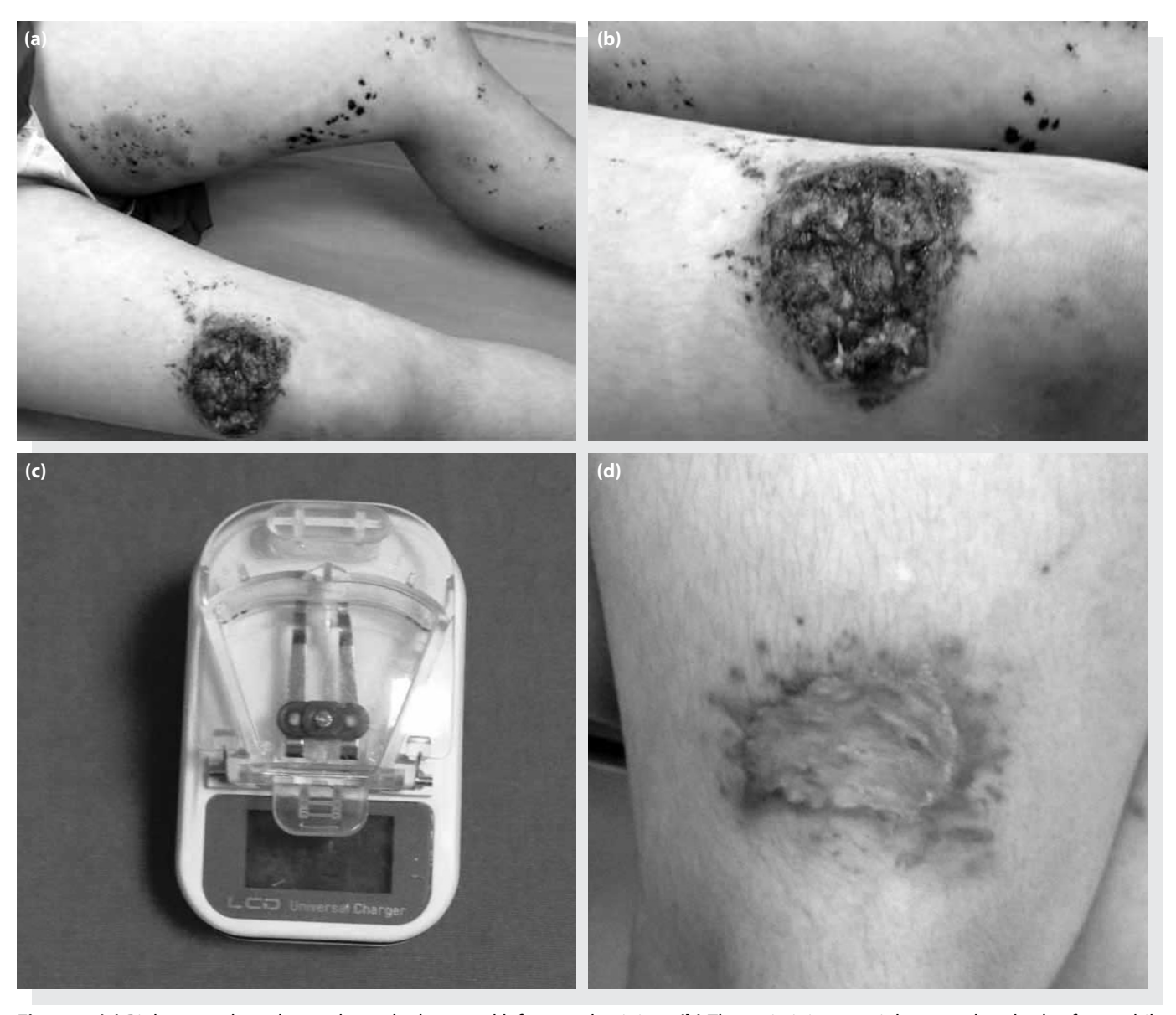
Figure 1.(a) Right anterolateral area above the knee and left upper leg injury. (b) The main injury on right upper leg shorly after mobile phone charger explosion. (c) Mobile phone charge adapter. (d) The final postoperative appearance of the injured region after immediate debridement and graft operation.

was consultated with a plastic surgery office and underwent rapid debridement and corruption preparation. There was no postoperative problem, and she was discharged with antibiotherapy (cephazoline). Dressing change on every other day was also suggested to the patient. There were no complications during the follow-up time as well. Figure 1d showed the final appearance of the right anterolateral area with a skin graft.