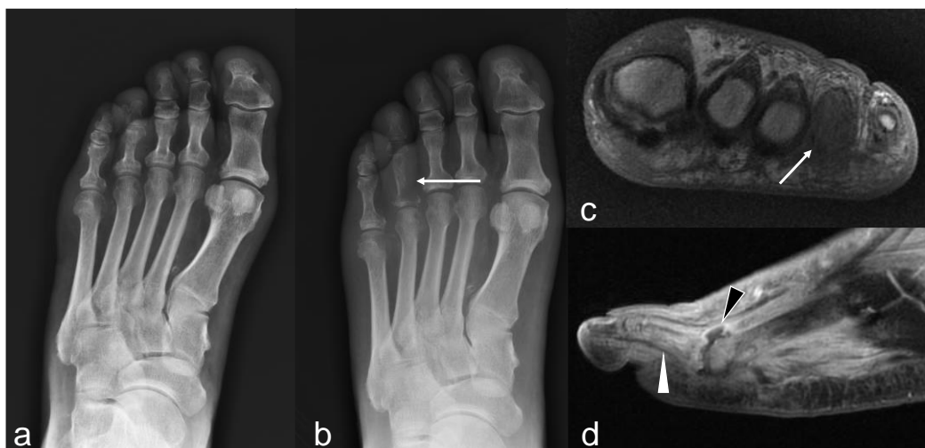
Figure 3. 67-year-old man with 24-years history of diabetes. (a) Anteroposterior view of the foot does not show any relevant finding. (b) Corresponding anteroposterior view obtained 16 days later shows extensive bone destruction at the base of the fourth proximal phalanx (arrow). (c) Coronal T1-weighted MR image demonstrates diffuse bone marrow hypointensity of the fourth proximal phalanx (arrow). (d) Sagittal post-contrast T1-weighted fat-suppressed MR image shows capsular distension and synovial post-contrast enhancement of the fourth metatarsophalangeal joint indicative of infected/septic arthritis (black arrowhead). Thus, the diffuse post-contrast enhancement of the fourth proximal phalanx is consistent with acute osteomyelitis (white arrowhead).

retrospective design, and the small population sampling may be prone to selection bias. Second, although radiographic findings were compared with MR imaging (the imaging modality of choice in this setting), we could not confirm data with bone biopsy for all patients. Finally, patients underwent radiography with the clinical suspicion of osteomyelitis; however, accurate information about the clinical signs and symptoms was frequently lacking, though the appropriateness and detail