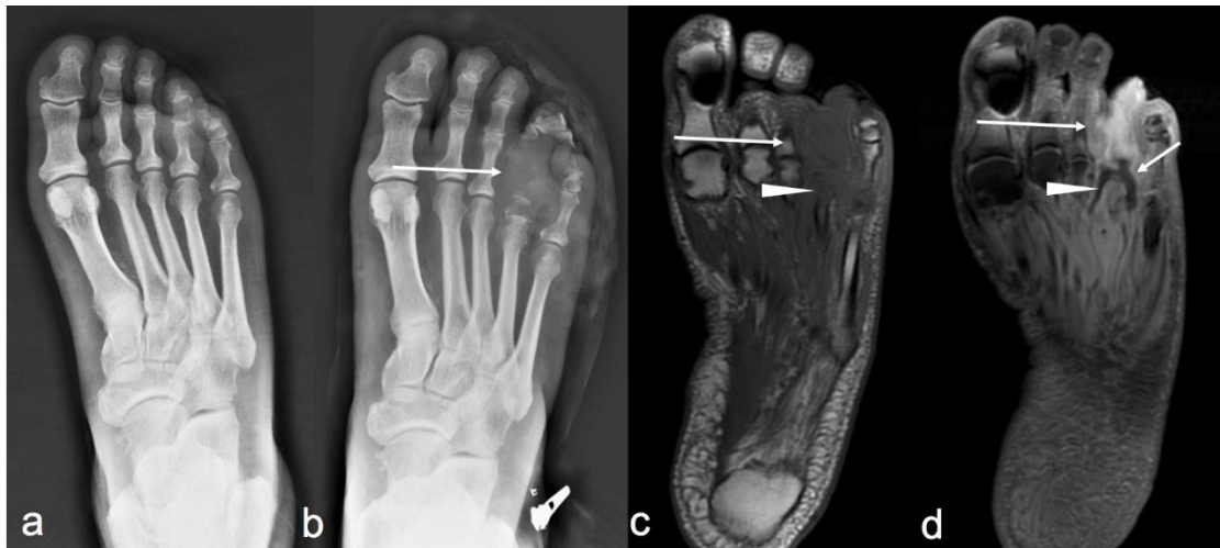
Figure 2. 62-year-old man with 16-years history of diabetes. (a) Anteroposterior view of the foot does not show bony abnormalities. (b) Corresponding anteroposterior view obtained 21 days later shows extensive bone destruction of the fourth proximal and intermediate phalanx with associated soft tissue thickening (arrow). (c) Axial T1-weighted and (d) axial post-contrast T1-weighted fat-suppressed MR images confirm phalangeal destruction (arrow in c, and d) extending to adjacent metatarsal head with decreased signal intensity (arrowhead in c) and post-contrast enhancement (arrowhead in d). Note also an adjacent soft tissue abscess with peripheral post-contrast rim enhancement (small arrow in d).