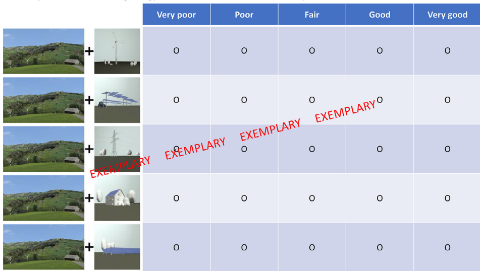
Fig. 2. Exemplary set of landscape-technology fit evaluation.

How do you think the following energy infrastructures fit with these landscapes?