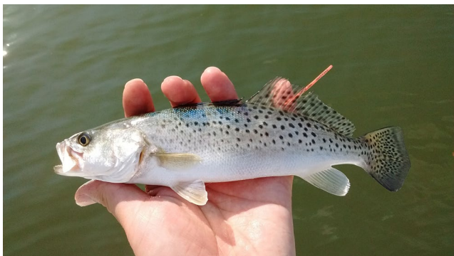
FIGURE 1 Spotted seatrout, Cynoscion nebulosus , on York River, Virginia.

The quality of the de novo-assembled spotted seatrout liver transcriptome was assessed using QUAST and BUSCO. QUAST indicated that this transcriptome contained 21,316 transcripts longer