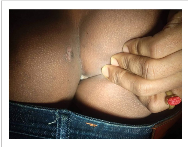
Figure 1. Single, ulcerated, indurated, plaque present over the left perianal region.