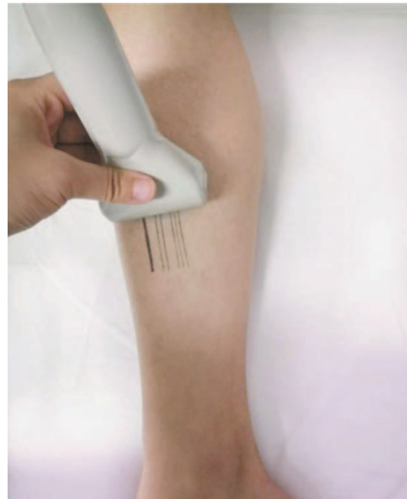
Figure 1. The method used to mark the 7 parallel lines at 1 mm intervals with its corresponding gray scan image (Fig. 2). Measurement of the elastic modulus in the areas with different thickness of subcutaneous fat followed by marked lines.

The SPSS software (version 20.1, SPSS, IBM) was used for data analysis. Continuous variables were expressed as mean \pm