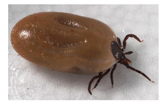
Fig. 16.9 Tick engorged with blood

Laboratory studies are typically normal in tick paralysis with CSF showing classically normal WBCs and protein. MRI imaging of the brain will be normal.