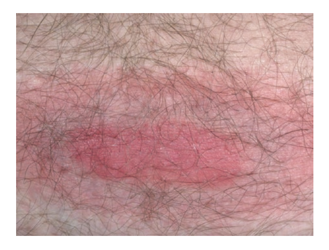
Fig. 16.4 Lyme disease, erythema migrans

If the early localized stage is not treated, the spirochete will then enter the blood stream resulting in the early disseminated stage , manifesting as disseminated erythema migrans lesions. Neurological sequelae include lymphocytic meningitis, cranial nerve palsies (especially facial nerve), radiculopathy (Bannwarth syndrome), peripheral neuropathy, or rarely cerebellar ataxia or encephalomyelitis. Lyme disease is one of the few causes of bilateral facial nerve palsies. Lyme meningitis will present similarly to other viral meningitis in addition to erythema migrans, possible