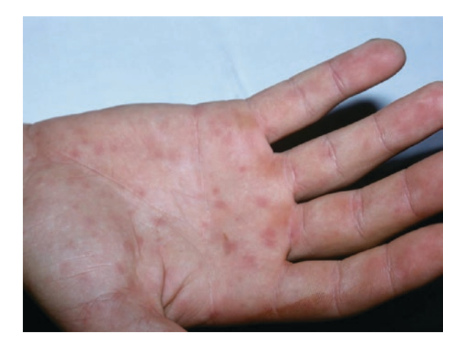
Fig. 16.2 RMSF rash adult