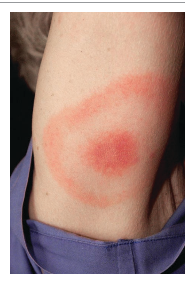
Fig. 16.5 Lyme disease, erythema migrans.

cranial nerve palsy or palsies, papilledema, prolonged duration of symptoms, and minimal polymorphonuclear cells in the CSF. Facial nerve palsy without signs of central nervous system infection (e.g., severe headache, vomiting, nuchal rigidity, or papilledema) does not necessarily require a lumbar puncture.