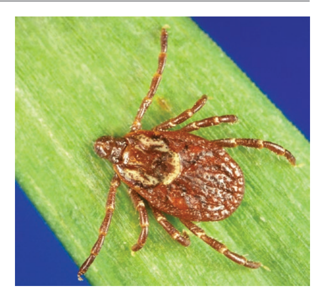
Fig. 16.1 Dog tick Dermacentor variabilis.

indistinguishable from a tick bite. Transmission of the tick-borne infection from the tick to the host occurs while the tick is feeding and has been attached to the host for about 6–10 h. Additionally, infection can be transmitted due to crushing of the tick during removal.