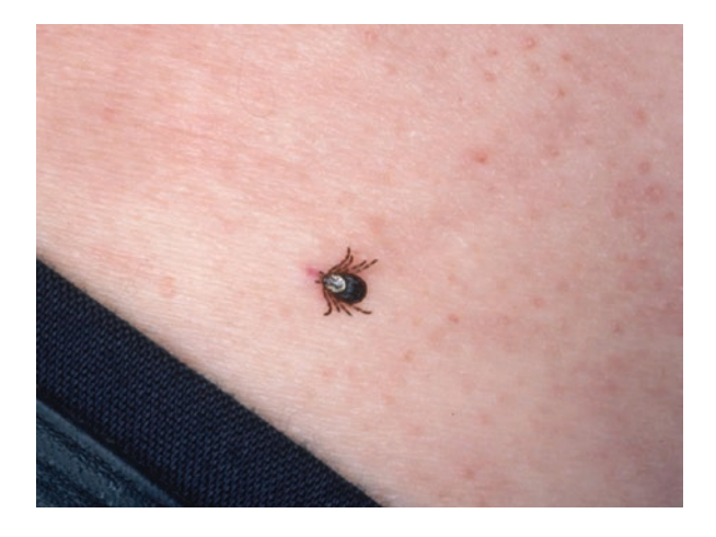
Fig. 16.7 Ehrlichiosis