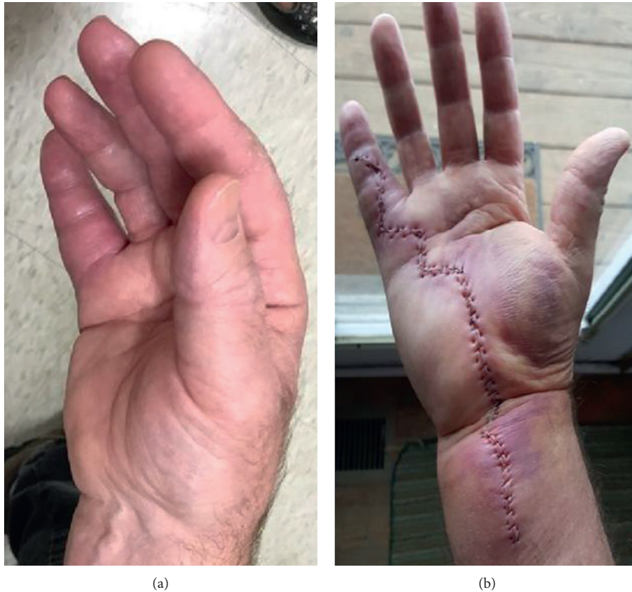
FIGURE 1: (a) Preoperative and (b) postoperative hand.