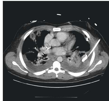
FIGURE 2: Horizontal section of chest computed tomography (CT) with contrast showing left-sided, multiloculated pleural effusion, status postplacement of pigtail catheter. Multifocal areas of necrotizing pneumonia and multiple pulmonary abscesses with smaller right-sided pleural effusion are also shown.

showed edema within the fascial compartments between the gastrocnemius and soleus muscles, as well as in the superficial fascia. A crescent-shaped subfascial fluid collection was also noted over the medial head of the gastrocnemius muscle, indicative of right lower leg fasciitis. The decision was made to proceed with incision and drainage of the fluid collection, in addition to a debridement of the right leg necrotizing fasciitis. Abscess drainage resulted in approximately 500 ml of purulent foul-smelling fluid, some of which was sent for gram stain and culture. A wash out of the right lower extremity wounds would be performed several days later with subsequent placement of negative pressure wound dressing.