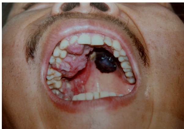
Fig. 1. Clinical setting of a 31-year-old patient with oral melanoma in hard palate with a 7-year disease length.