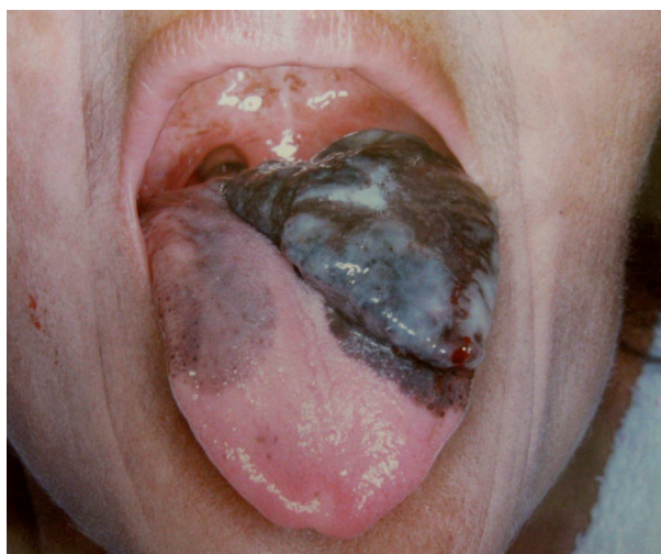
Fig. 2. Female 44-year-old patient with oral melanoma in tongue with a 2-year disease length.