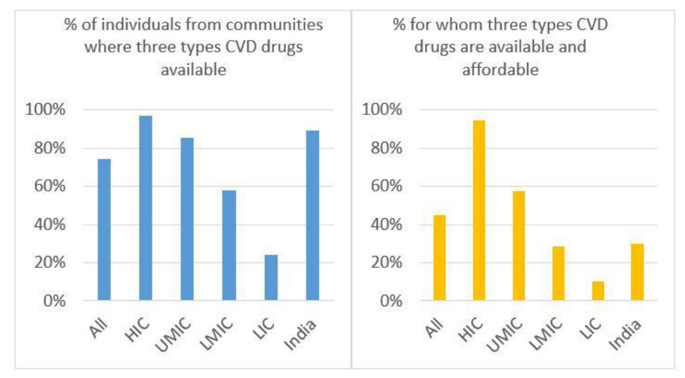
Figure 1 Percentages of individuals with high CVD risk from communities where three types of CVD medicines are available (left) and affordable (right). CVD, cardiovascular disease; HIC, high-income countries; LICs, low-income countries; LMICs, lower middle-income countries; UMICs, upper middle-income countries.

supplemental appendix table S5 and S6), different thresholds for capacity to pay (10% or 25%, online supplemental appendix tables S7–S9) and different definition of high risk individual (the non-laboratory INTER-HEART risk score, <sup>17</sup> online supplemental appendix tables S10–S13).