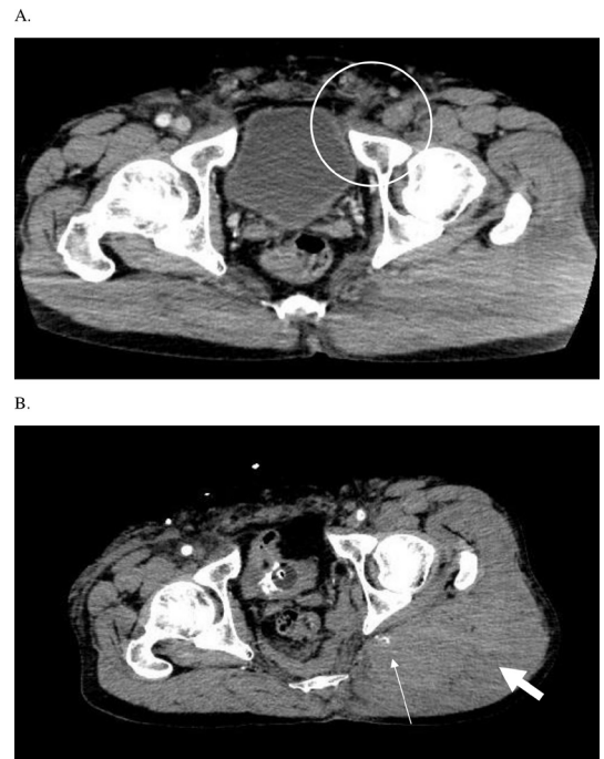
Figure 1 (A) Contrast-enhanced CT shows that the left common femoral artery is not visible (circle). (B) Gluteal hematoma (thick arrow) with extravasation of contrast medium from the left inferior gluteal artery (thin arrow).

We first performed angiography, accessing the right CFA and placing an introducer. Aortography revealed left CFA flow defects. Blood flow was intact distal to the superficial–deep femoral artery's bifurcation. Contrast medium extravasation was seen from the left inferior gluteal artery into the left gluteal hematoma. Because the dissection was focal (within 2 cm), we introduced a percutaneous transcatheter angioplasty (PTA) balloon (8–10 mm diameter, 4 cm long) over a guide wire into the CFA and insufflated it to expand the vessel, where it remained for 20 s, three times. Intravenous heparin (5000 U) was used. Flow was restored in the CFA