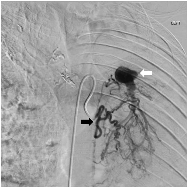
Fig. 2 – Selection of the left bronchial artery (black arrow) with a 5-French Shetty catheter (Cook Medical, Bloomington, IN, USA) demonstrated a markedly tortuous, hypertrophic network of vessels with shunting to the left pulmonary artery (white arrow). Despite multiple attempts, a microcatheter was unable to be advanced distally into the left bronchial artery.

Initial aortogram demonstrated hypertrophied bilateral bronchial arteries, without clear additional systemic arterial source of hemoptysis. Angiogram of the single left bronchial artery demonstrated it to be enlarged, tortuous, and with significant shunting to the left lower pulmonary artery (Fig. 2). Despite multiple attempts with several catheters