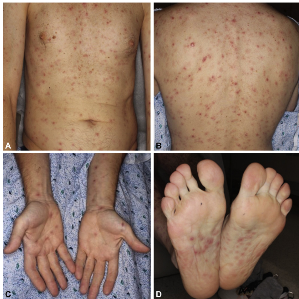
Fig 2. Crusted erythematous macules and papules on the chest (A), back (B), bilateral palms (C), and soles (D) were appreciated on initial presentation to Dermatology.

After receiving treatment, the patient's fever, night sweats, and rash subsided (Fig 3). He gained 4 kg since treatment; his lymphadenopathy resolved clinically, and the resolution of lymphadenopathy was confirmed by imaging. Three months later, a repeat rapid plasma reagent test revealed a 4-fold decline in the titer (1:4) demonstrating an appropriate response to treatment.