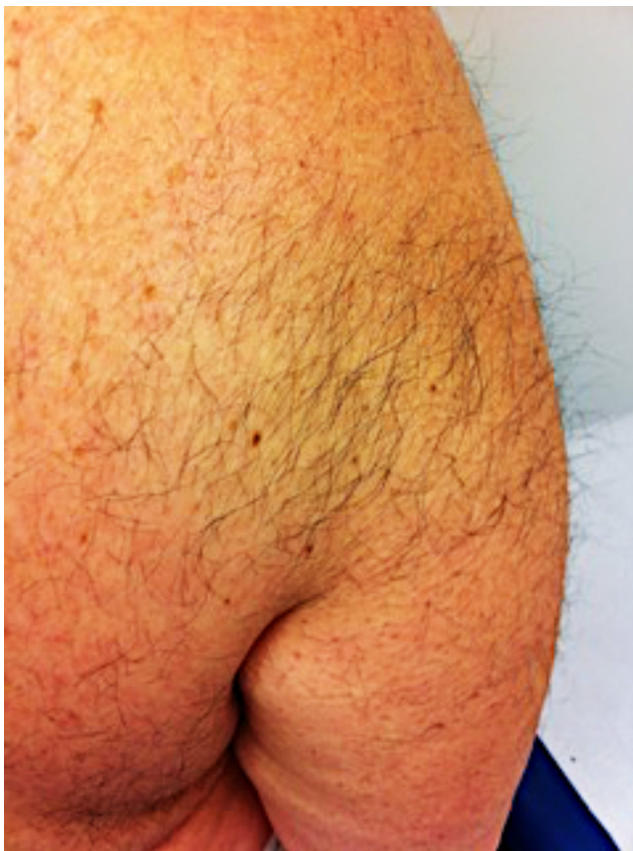
Figure 1 Marked skin redness and hirsutism on the back and right upper limb. Captioned on first consultation.

virilizing signs or symptoms (Fig. 1). Her menarche was at 13 years, she had regular menses until reaching menopause at 51 years and there was no pre or post-menopausal metrorrhagia history. She reported one uneventful pregnancy with term vaginal delivery, one 7-month in utero death for no clearly understood reason and one voluntary termination of pregnancy. She was diagnosed with essential hypertension and dyslipidemia at the age of 50 years and had progressive weight gain over the years. At the age of 56 years, she was diagnosed with type 2 diabetes. No previous surgeries were reported and family history was unremarkable. Her regular medication was metformin (2000 mg/day), losartan (50 mg/day) and spironolactone (25 mg/day). She was not taking any drug with androgenic effects. On physical examination, she had obesity (abdominal perimeter 109 cm, BMI 37 kg/m 2 , class II of WHO classification) and had evident frontotemporal alopecia and increased terminal hair growth, particularly on her back, arms and forearms.