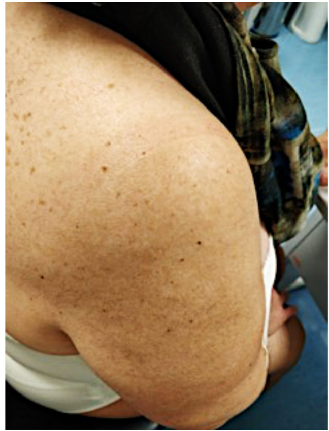
Figure 4 Complete resolution of presenting signs 8 months after surgery.

treatment that is an inhibitor of aldosterone and also a weak competitive inhibitor of androgen binding to the androgen receptor and a weak inhibitor of testosterone synthesis. The biochemical profile, as well as a CT scan negative for adrenal tumors, did not favor the adrenal etiology. On the contrary, ovarian tumors are easily missed by imaging making an ovarian androgen origin more likely. Accordingly, we decided to perform a bilateral salpingo-oophorectomy with hysterectomy, which afterward proved to be curative (Fig. 4). Histological diagnosis was bilateral ovarian stromal hyperplasia (Figs 2 and 3). This is a benign entity usually referred in close association with the presence of nests of luteinized theca cells in the ovarian stroma (termed as Ovarian Hyperthecosis), which curiously were not identified on our histological examination (Figs 2 and 3). Its etiology is still not well understood. It is most frequently seen in postmenopausal women and is characterized by severe clinical and biochemical hyperandrogenism and insulin resistance, generally more exuberant than observed in other benign etiologies (3). Definitive diagnosis is established by histology. Due to increased androgen secretion, these