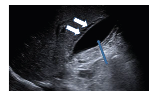
FIGURE 2: Ultrasound of the right upper quadrant showing the gallbladder free of stones (blue arrow) and thickening of gallbladder wall (white arrows).