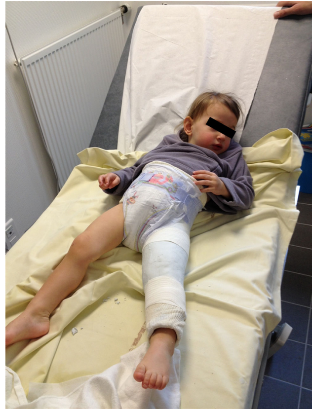
Fig. 1 Photograph of a 2-year-old girl after temporary spica cast immobilization before MRI for great trochanter chronic pain

fast-spin echo and/or short tau inversion recovery. Intravenous contrast material was used in cases where bone viability needed to be assessed, in cases of suspected infection or in bone and soft-tissue tumors. Parents stood