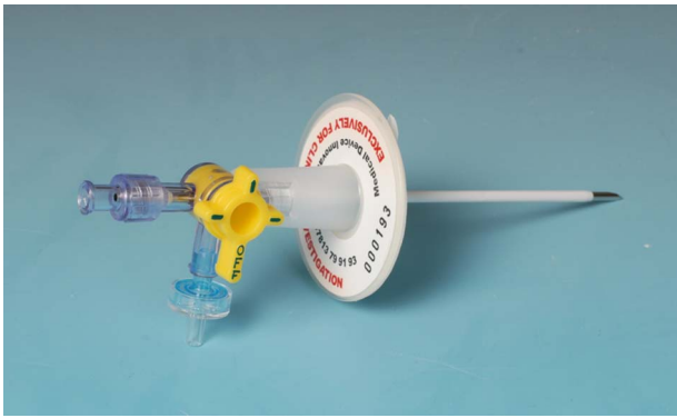
Figure 1 ThoraQuik I device.