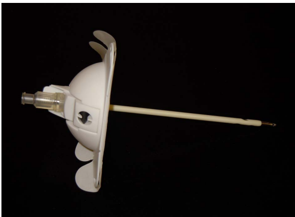
Figure 2 ThoraQuik II device.

The secondary objective of the study was to obtain qualitative evaluations of operator handling of the ThoraQuik II device.