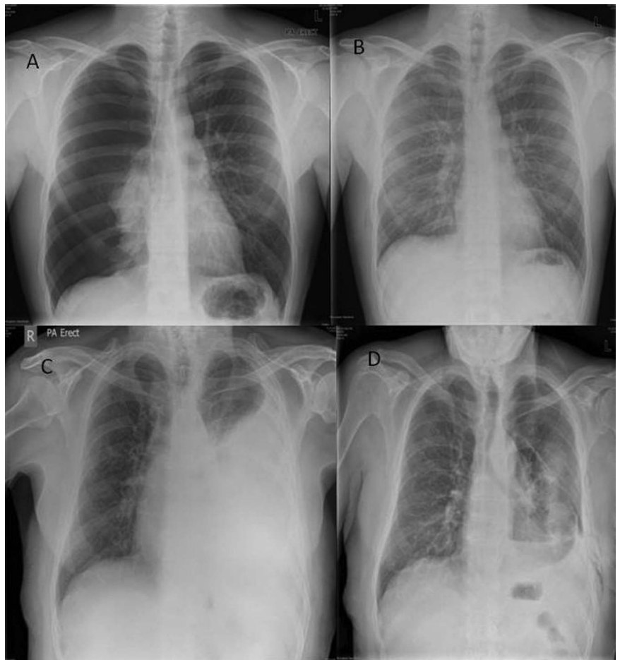
Figure 5 Outcomes with ThoraQuik II. (A) Pneumothorax before ThoraQuik II insertion, (B) postdrainage film showing resolution of pneumothorax, (C) pleural effusion before drainage with ThoraQuik II and (D) postdrainage film showing resolution of pleural effusion.