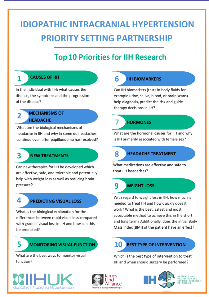
Figure 2 Final top 10 ranked uncertainties for concerning the treatment and management of people with idiopathic intracranial hypertension (IIH).

group members. All responses were refined to understandable 'uncertainties' with the exception of those considered to be 'out of scope'. These were categorised using the UK Clinical Research Collaboration Health Research Classification System, sorted into themes and then formulated into indicative questions by steering group members, working in groups with at least one HCP and one patient representative. A literature search was conducted with the electronic databases, CENTRAL, Embase and MEDLINE, searched from inception to March 2018 for systematic reviews using strategies based on those used by Piper et al.<sup>2</sup> The 'known knowns' with reference to the appropriate literature and duplicate questions were removed. Questions were amalgamated when practical to do so. The long list was then verified by the PSP lead and discussions were held with the wider steering group if disagreements occurred.