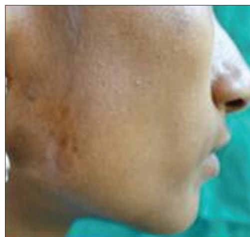
Figure 7: Follow-up after 1 year.

during its course, and these structures are at risk of injury during surgery for the duct fistula. Wounds across this line should be assessed meticulously for injury to these structures. 1