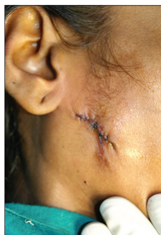
Figure 6: Suturing.