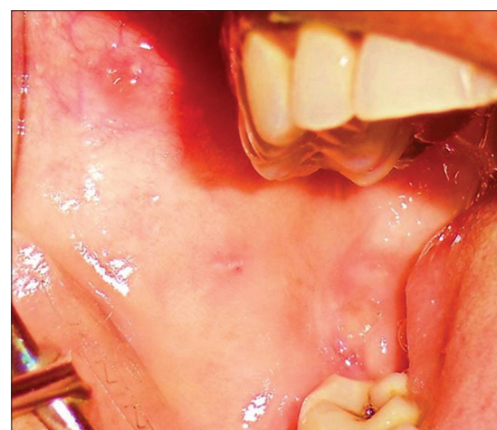
Figure 2: Salivary flow intra-orally.