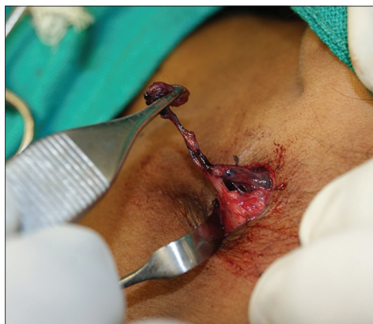
Figure 5: Relation of fistulous tract with Stenson's duct.

The course of the duct can be marked on the surface as the middle third of a straight line drawn from the anterior aspect of the tragus to the midpoint of the upper lip. The duct is accompanied by the buccal branch of the facial nerve and the transverse facial artery