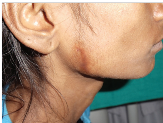
Figure 1: Pinpoint opening over scar tissue.

Patient was taken under short general anesthesia; methylene blue ink was injected into the fistulous opening using a 26-gauge needle to identify the tract. An elliptical incision of 1 cm diameter was taken around the fistulous opening, which included the scar tissue. The skin island was then held with skin hooks and the subcutaneous tissue dissected until the fistulous tract containing dye was visible.