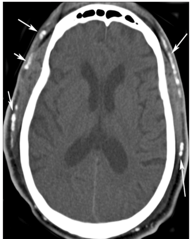
Figure 2: Axial CT scan of the head of a 55-year-old nondiabetic, hypertensive male with ESRD shows multiple, bilateral, calcific foci (arrows) in the STA