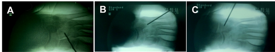
Figure 2 An X-ray machine was used to determine the midpoints of the (A) intermediate cuneiform, (B) lateral cuneiform, and (C) cuboid.

point “b.” The midpoints of the intermediate cuneiform, the lateral cuneiform, and the cuboid were defined as points “c,” “d,” and “e,” respectively (Figure 3A). PTT was then re-routed to reach the midpoints of the intermediate cuneiform, the lateral cuneiform, and the cuboid by applying 10 N pre-tension; during this procedure, the limb was placed in a neutral position (Figure 3B, C). We fixed one end of a suture to the point of “a,” then pulled this suture to the points of “b,” “c,” “d” and made markers on the suture, respectively. The lengths of “ab,” “ac,” “ad,” “ae” were measured by determining the length of part of the suture which began from one end to the marker points, respectively. All the lengths of “ab,” “ac,” “ad,” and “ae” were individually measured. If the length of PTT was sufficient to reach the midpoints of the three bones, an angle was measured between the tendon outside the fascia connecting to the different bones and inner layers. To prevent the muscle-tendon force distribution, we placed the line of pull as close to the vertical line as possible. To measure the angle produced by tendon