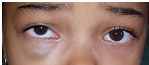
Figure 1 Swelling over the right infraorbital region.

The present case is unusual, due to the onset of signs after age 4 years. For most infants with infantile hemangioma, involution begins between 6 and 12 months of age. Although the process continues over years, the majority of