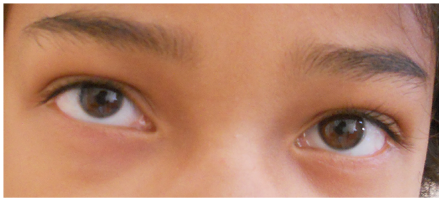
Figure 3 Complete disappearance of the orbital hemangioma (11th-month).

tumor regression occurs before age 4 years. Although most infantile hemangiomas resolve spontaneously, some may warrant medical or surgical treatment, because of interference with function or life-threatening physiologic compromise.