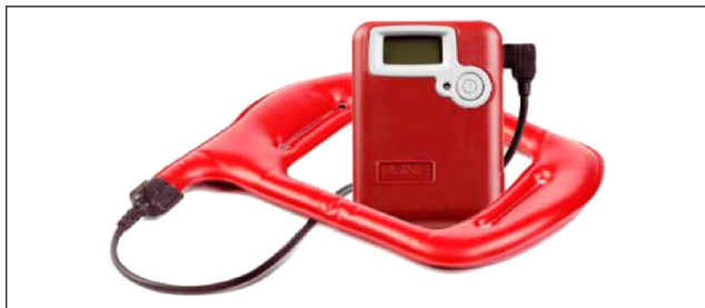
Figure 1. I-ONE pulsed electromagnetic fields (PEMFs) generator.

All patients were treated with 2 intra-articular injections (1 monthly) of leukocyte-rich PRP. The study revealed that the use of PRP in patients with chronic degenerative disease of the knee could act to diminish pain and improve symptoms and quality of life. A prospective randomized study comparing PRP to High molecular weight (HMW) HA as well as Low molecular weight (LMW) HA reported superior outcomes at 6 months with PRP injection (3 injections). 58