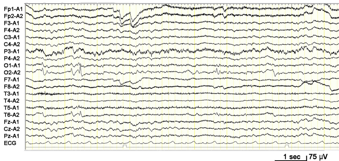
Fig. 3. EEG performed while awake at 13 years of age. The EEG showed bilaterally independent occipital spikes.

with his relatives and showed an interest in television programs. The patient's EEG on day 35 showed only bilateral occipital focal spikes (Fig. 3).