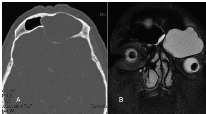
Fig. 1 (A) Axial CT image of the paranasal sinus showing an extensive, homogeneous mucocele in the left frontal sinus, with apparent bone defect of the posterior wall. (B) MRI showing extensive T2 hyperintensities indicative of mucocele in the left frontal sinus, with associated extension to the ipsilateral orbit.

Intraoperative complications occurred in three cases: one minor lamina papyracea injury and two cases of heavy bleeding controlled during surgery, with no need to interrupt the procedure and no need for transfusion.