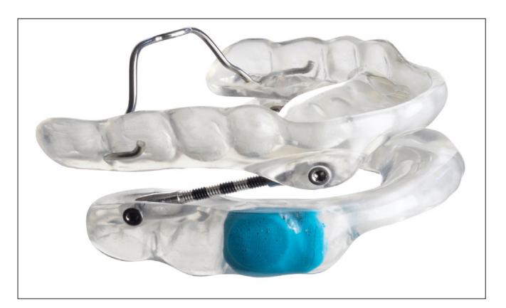
Figure 1. The Protrusor<sup>®</sup> MAD device. It is made of two resin splints connected by two threaded titanium bars, which can be regulated to reach the desired amount of mandibular advancement. A chip for compliance monitoring is embedded in the lower resin splint.

All patients were instructed to wear the MAD: an initial mandibular advancement of 70% of the total possible