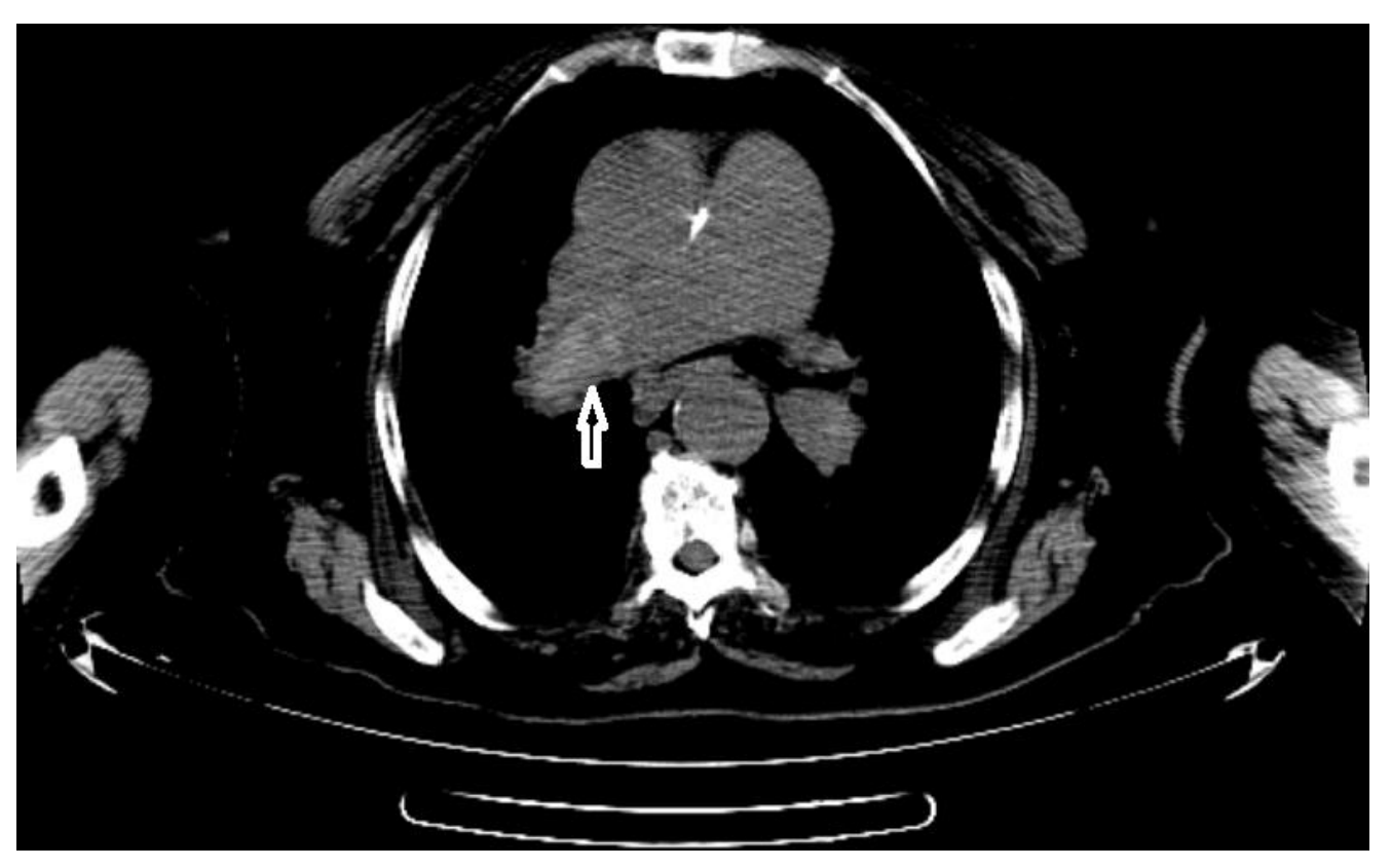
Figure 1: Unenhanced CT of the chest demonstrates hyperdense material within the right main pulmonary artery