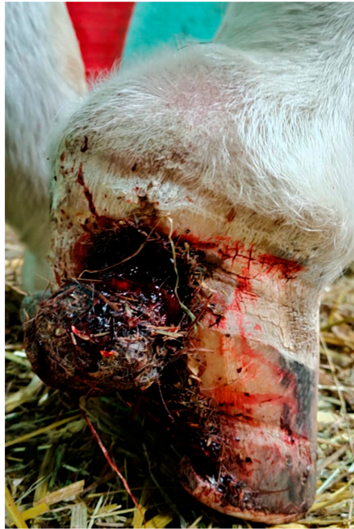
Figure 1. Lateral aspect of the right forelimb hoof with a bleeding full thickness vertical quarter crack and an exuberant mass protruding from the hoof crack. The mass was brown in color and had a nut-shape with hard and rough consistency.