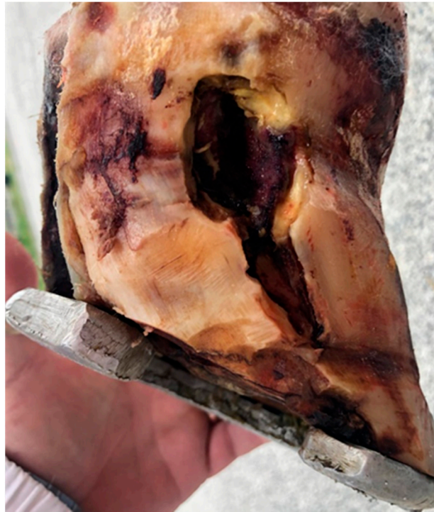
Figure 3. Second surgery: extensive debridement of the hoof crack.

The horse was premedicated with acepromazine (20 µg/kg IM) and sedated with medetomidine (7 µg/kg IV); general anesthesia was induced with ketamine (2.2 mg/kg IV) and diazepam (0.06 mg/kg IV) and maintained with isoflurane and a constant rate infusion of medetomidine (3.5 µg/kg/h IV). A cleansing and extensive debridement of the crack (Figure 3), with a loco-regional cephalic perfusion with 2 g of cefazoline, was performed. A foot bandage was applied and changed at 2 to 3-day intervals.