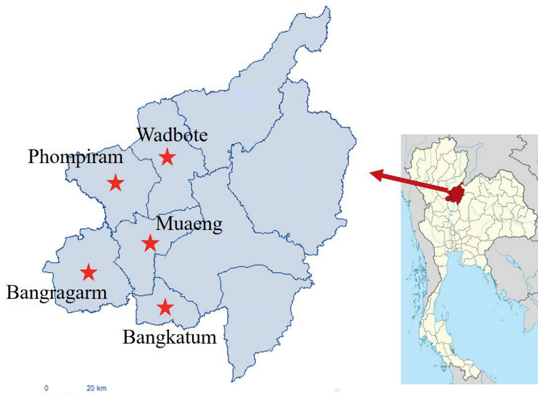
Fig. 1. Five districts which were investigated for parasitic infections in small ruminants.

A cross-sectional study was conducted from May 2019 to January 2020 in Phitsanulok, lower northern Thailand. (16.78°North, 100.20°East). Five districts; Muaeng, Bangragarm, Phompiram, Wadbote and Bangkatum in Phitsanulok province were selected for this research (Fig. 1). These districts are located at an altitude of 44 m above sea level. These areas are characterised by