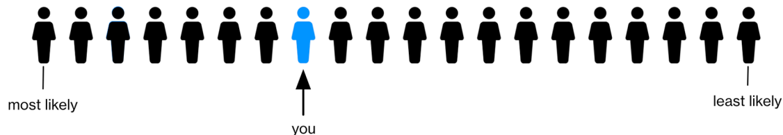
Figure 3 Illustrative example of a queue or ranking system for communicating cardiovascular risk.

We estimate you would move to 8th place.