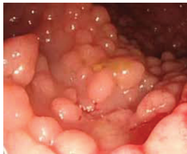
Figure 1. Endoscopic image of sigmoid colon of familial adenomatous polyposis (FAP) patient

Also, they could have significant roles on many pathways that associated with the disease (19, 127, 128). As an effective high-throughput tool, NGS would possibly replace current screening strategies for polyposis. Last but not least, future studies will help to describe whether special epigenetic perspectives would be necessary and allow transformation by oncogenes such as RAS family (124).