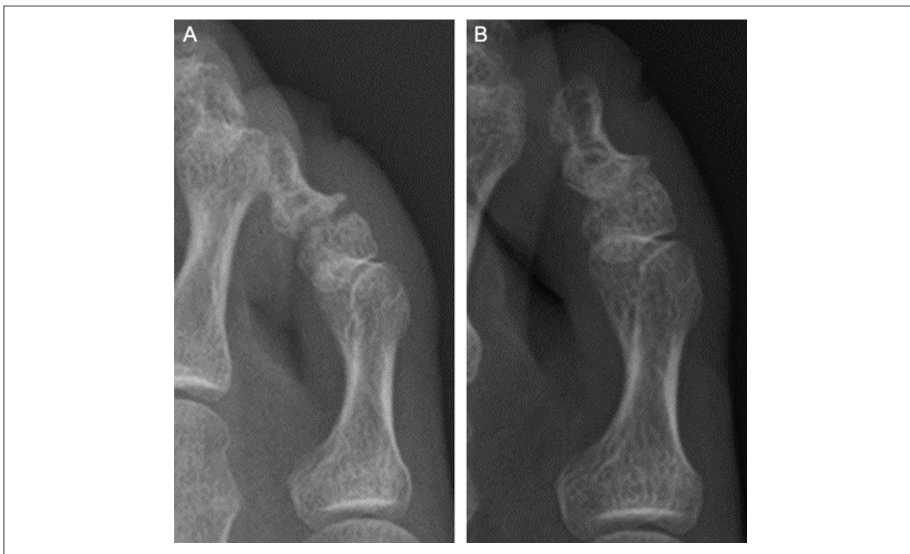
Figure 1. Sixty-four-year-old woman. (A) Nonunion on radiograph 3 months after the injury. (B) Bone union on radiograph 1 week after 3 ESWT sessions (7 weeks after ESWT initiation). ESWT, extracorporeal shock wave therapy.