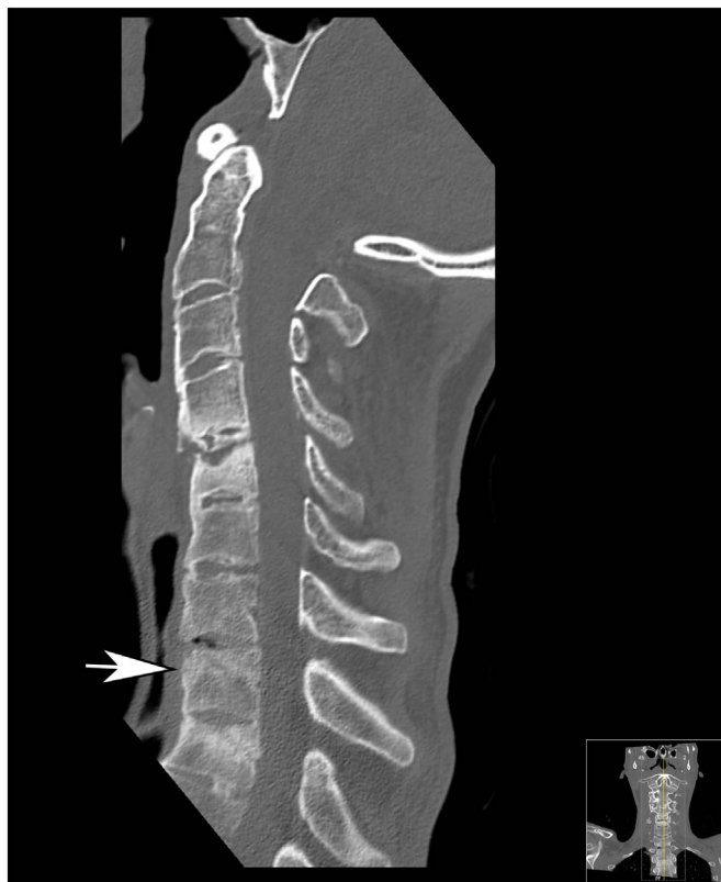
Fig. 2. (continued)