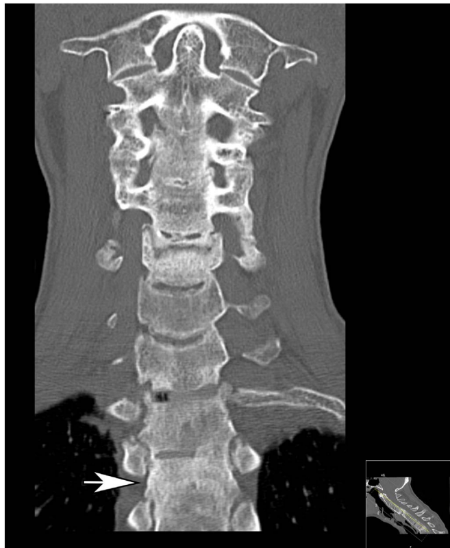
Fig. 2. Healed T2 vertebra. Coronal view. Healed T2 vertebra. Sagittal view.

To note is that our patient was also receiving Secukinumab during his treatment with Teriparatide. Randomised placebo controlled trials show good clinical improvement in AS with Secukinumab [20] however there is no evidence supporting its role in fracture healing.