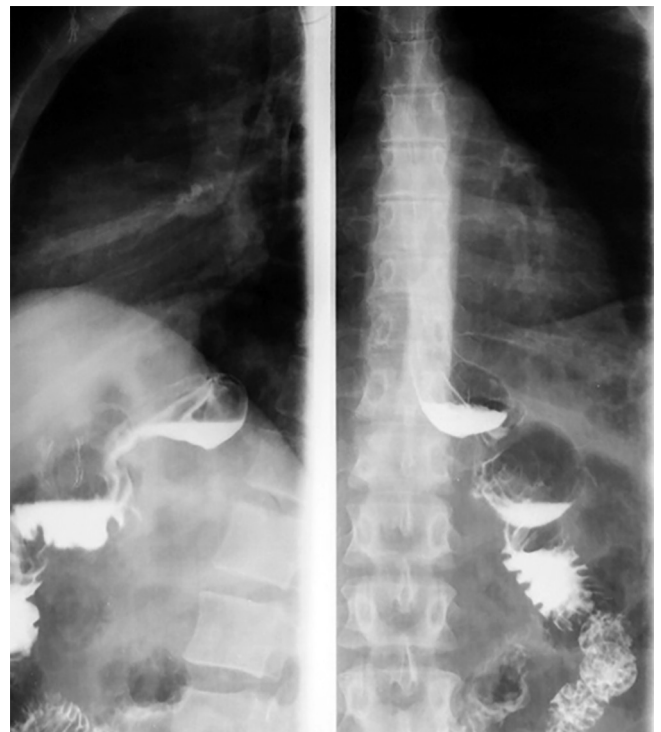
FIGURE 2 – Contrast radiography illustrating the result of the proposed revisional operation