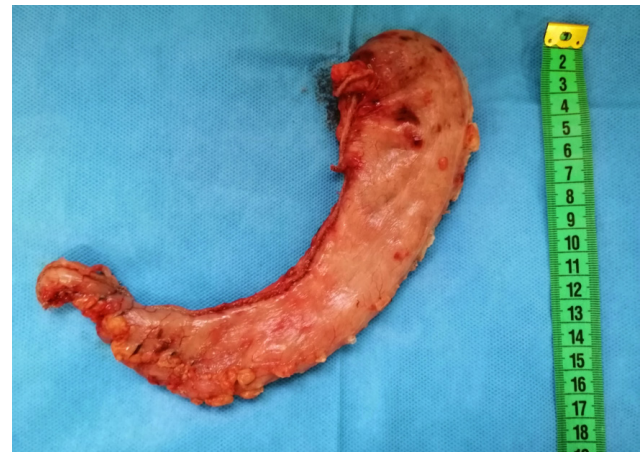
Figure 1. Specimen after laparoscopic sleeve gastrectomy.

was created by sequential application of staplers. Hemostasis at the level of the staple line was performed by applying metal clips. At the end of the intervention, the staple line was checked for any leaks by introducing the methylene blue solution through a nasogastric tube. The resected stomach (Figure 1) was extracted through the left port (through the 12 mm trocar place) and a drainage tube was left in place for the next 48 hours.