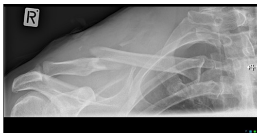
Figure 1 Anteroposterior X-ray of right shoulder demonstrating clavicle fracture.

To cite: Arnold S, Gilroy D, Laws P, et al. BMJ Case Rep 2021; 14 :e241382. doi:10.1136/bcr-2020-241382