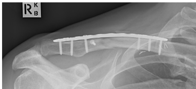
Figure 4 Follow-up clavicle X-ray demonstrating early callous formation.

The patient was immediately transferred to the operating theatre under the combined care of our Vascular, Interventional Radiology and Orthopedic teams, and a general anaesthetic was administered. A percutaneous puncture of the right groin was made to access the right common femoral artery (CFA). A 9 French sheath was placed within the CFA. An endovascular catheter and guide wire were inserted and manipulated proximally through the aorta, through the brachiocephalic trunk, into the right subclavian artery. An angiogram demonstrated contrast extravasation from the third part of the subclavian artery, corresponding to the injured segment seen on the CTA. The wire and catheter were able to be passed across the injured segment. An intravascular position was again confirmed by repeat angiography. The catheter was then removed. An 8×40 mm Armada balloon was introduced over the wire and inflated proximal to the injury (figure 3) to achieve proximal control. Contrast flow into the injured segment of subclavian artery ceased.