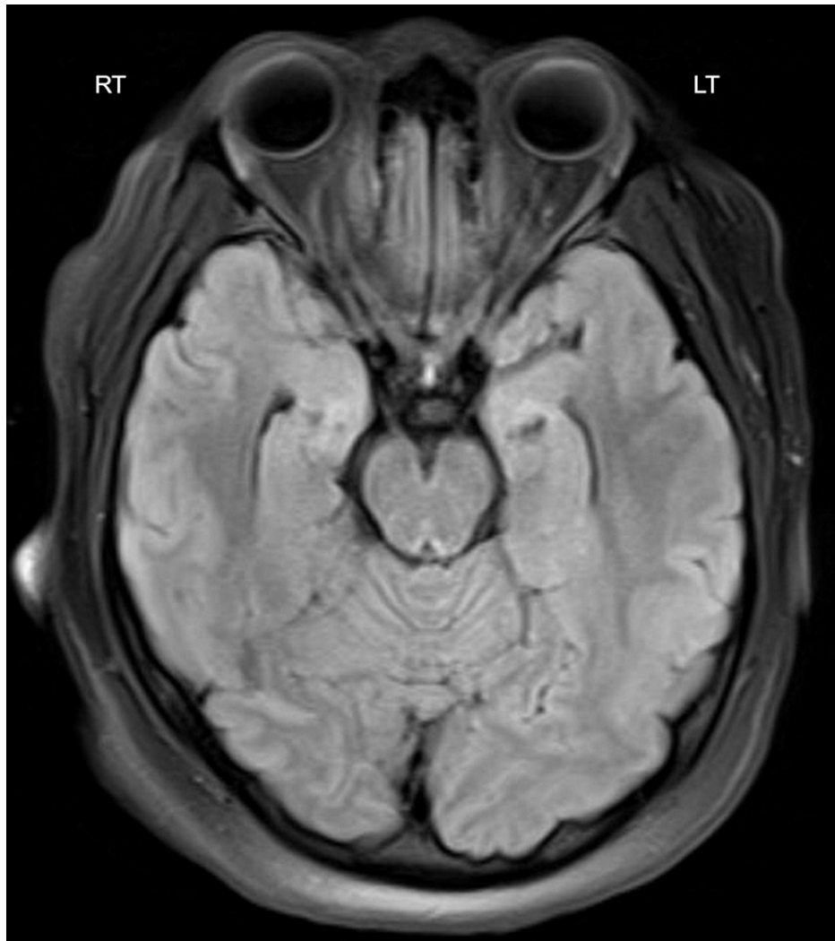
FIGURE 2: Normal axial flair T2-weighted MRI at the level of inferior colliculus

At two weeks follow-up with primary care, ophthalmology, and occupational therapy, she continued to improve with residual diplopia. She was continued on conservative management with an eye patch and physical therapy. Per ophthalmology, it may take six months for her diplopia to resolve completely. At two months follow-up, her diplopia had improved, and she was cleared for driving with a left eye patch.