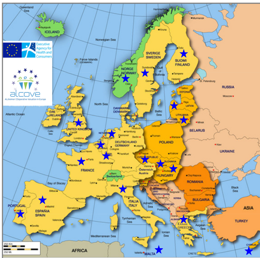
Figure 1 European Union Joint Action ALCOVE. (Alzheimer COoperative Valuation in Europe), 19 participating countries.

organisations have been designated by their national governments for their clinical, epidemiological or public health expertise in Alzheimer's disease and related dementias.